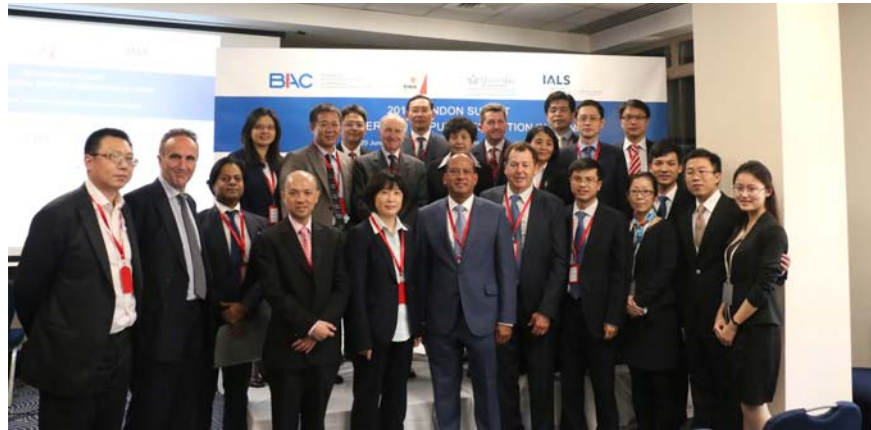
From 20th to 24th June 2016, BAC had travelled to London, Frankfurt and The Hague to organize the “2016 Annual Summit on Commercial Dispute Resolution in China”.

factors in specific cases (e.g. a dispute between two Foreign Invested Enterprises, which is usually deemed to be a domestic case under the Chinese law).