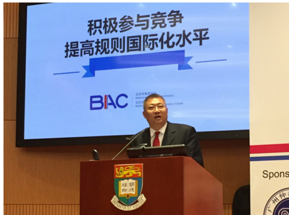
The 6th Arbitration forum in Great China Area was held in HKU on 6 May 2015.