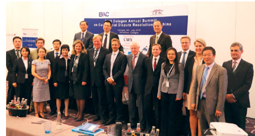
From 5th to 11th July 2015, BAC had travelled to London and Cologne to organize the "2015 Annual Summit on Commercial Dispute Resolution in China".