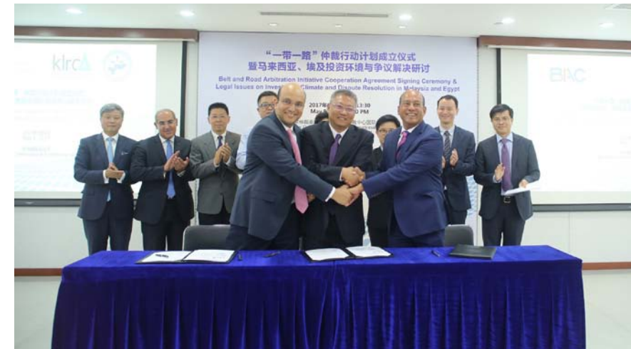
In-depth Exploration of Cooperation between Arbitration Institutions, Joint Promotion of Belt and Road Arbitration—Signing Ceremony of Belt and Road Arbitration Initiative & Legal Issues on Investment Climate and Dispute Resolution in Malaysia and Egypt