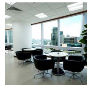
Case Filing Area