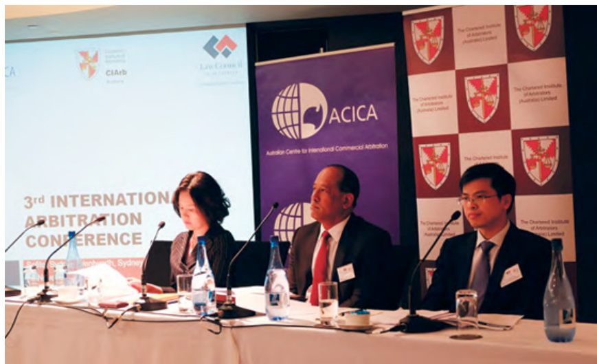
The 3rd International Arbitration Conference was held in Sydney on 24 November 2015.